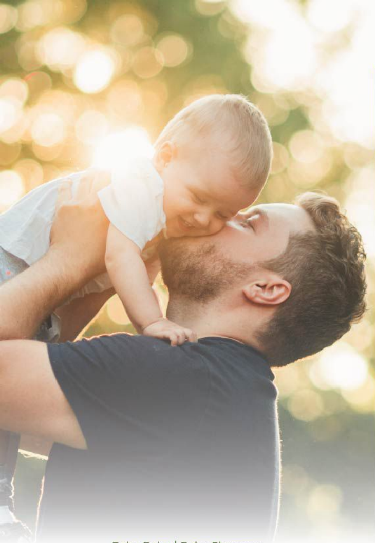
Baby Balm | Baby Shampoo Baby Moisturising Bath & Wash | Baby Oil